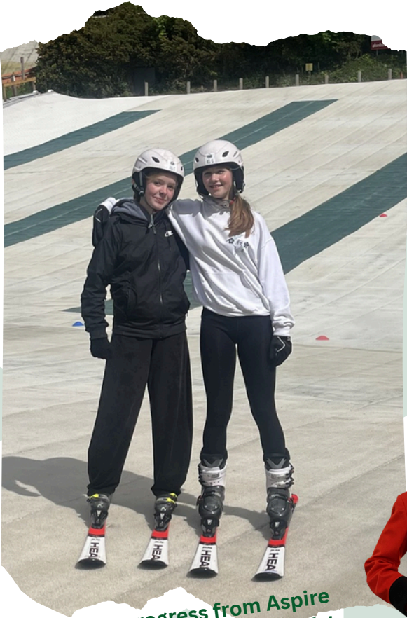
Amazing progress from Aspire skiers this week during Guilds!