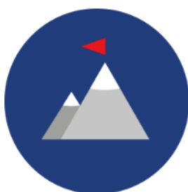
Enjoy the challenge