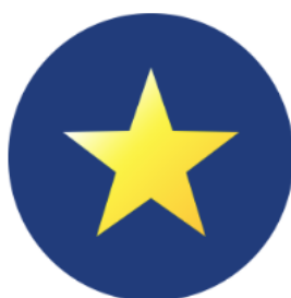
Anyone can excel

Share what is best – We achieve our diversity and practicing equality.