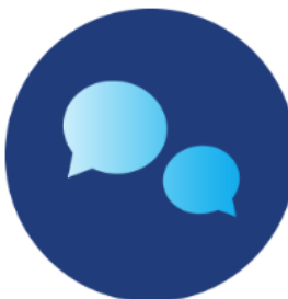
Share what is best