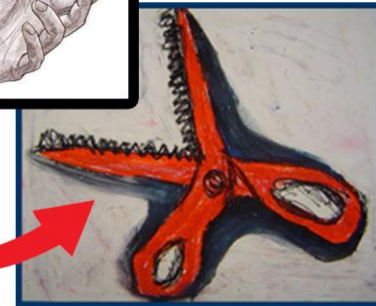
Artist Link: Banksy