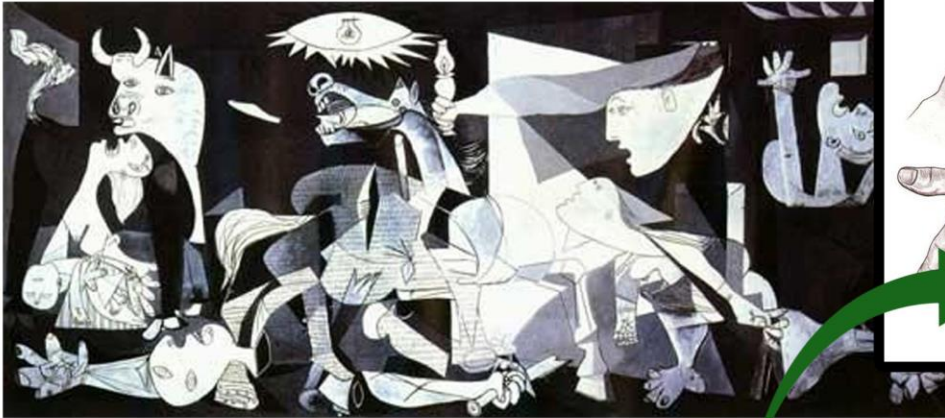
Artist Link: Picasso